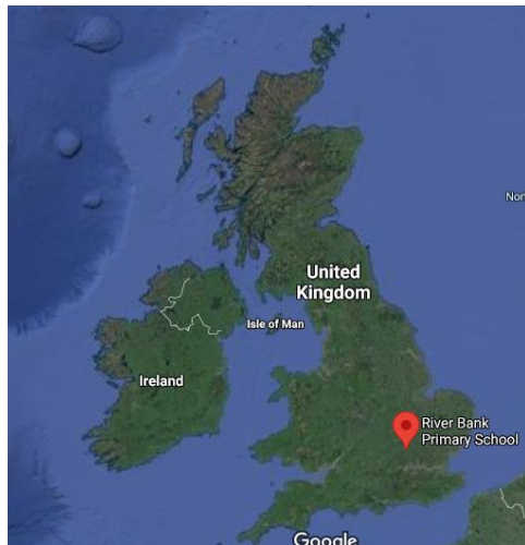
An Aerial Photo of our School in the UK