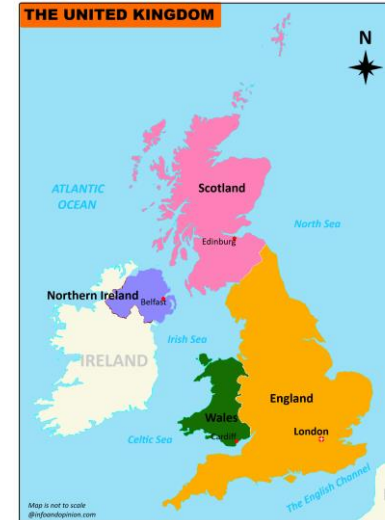
UK Map (Countries and Seas)