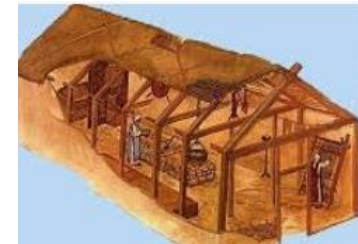
Rectangular Viking house