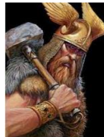
Popular God was Thor

The Viking age began more than 1200 years ago. AD 793 The first invasion by the Vikings. The Vikings came from 3 countries, Denmark, Sweden and Norway. During this period many Vikings travelled by longship to other countries like Britain and Ireland. The Vikings raided the local people, stealing from churches and burning buildings to the ground. Traditional Viking families had men working the land, with a wife taking care of the home and of the family valuables. Vikings spoke the Norse language. Lots of English words that begin with sk come from the Norse language like skirt, skill Vikings houses were built from locally built materials such as wood, stone or turf. They were long and rectangular. Not all Vikings were bad. Some settled as farmers, kept animals and grew crops. They were skilful at crafting, and made beautiful metalwork and wooden carvings. Vikings sailed the seas, trading goods to buy silver, silks, spices, wine, jewellery, glass and pottery to bring back to their homes. Vikings believed that there were lots of different gods. The most popular God was Thor.